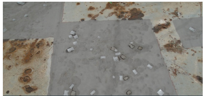
Defect Area - Before Repair