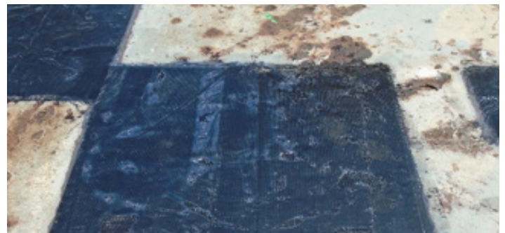
Defect Area - After Repair